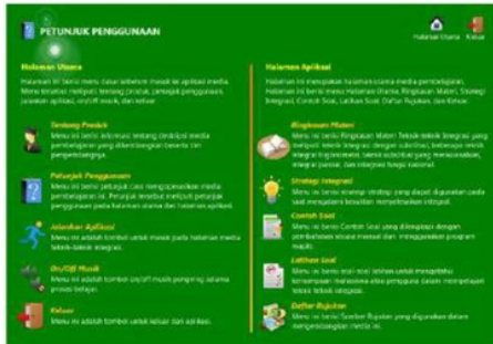
Fig. 4. Display of Media Instructions

use on the main page and the application page. Consider the following fig.4.