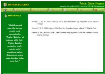
Fig.10. Display Menu References List

10) References List Menu. This menu contains the Referral Resources used in developing this media. Consider the following fig. 10.