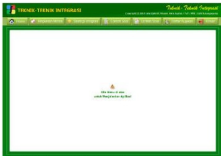
Fig. 5. Display of Media Application

This page is the main page of instructional media. this page contains the main page menu (home), material summary, integration strategy, sample questions, exercise questions, referral lists, and exit. Consider the following fig.5.