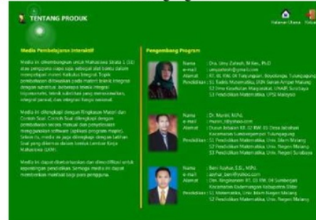
Fig. 3. Display of Product

This page contains information about developed instructional media descriptions and their development team. Consider the following fig.3.