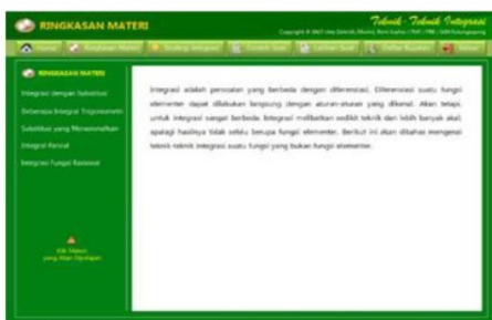
Fig. 6. Display of Material Summary Menu

This menu contains a Summary of Material Integration Techniques which include: integration with substitution techniques, some trigonometric integral techniques, rationalizing substitution techniques, partial integrals, and the integration of rational functions. Consider the following fig. 6.