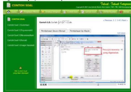
Fig. 8b. Display Menu Sample Exercise and Discussion Using the Maple Program