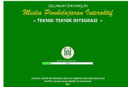
Fig. 1. Display of Media Splash Screen

This page is a Splash Screen media page or a preliminary page before entering the main page. This page is about welcome greetings to these interactive media users. It also contains an animated media loading process with the content of the message to wait a while. Consider the following fig.1.