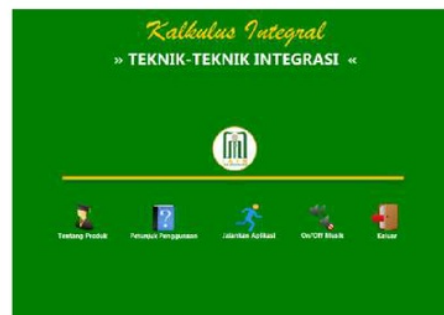
Fig. 2. Display of Main Page

This page contains the basic menu before entering the media application. The menu includes: about the product, instructions for use, running the app, on / off music, and exit. Consider the following fig.2.