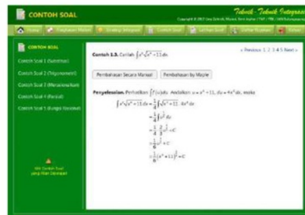
Fig. 8a. Display Menu Sample Exercise and Manual Discussion

This menu contains exercise sample that is completed with manual discussion and maple programming. Consider the following fig. 8a. and Fig. 8b.