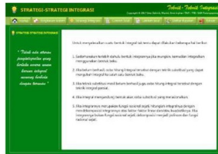
Fig. 7. Display of Integration Strategy Menu

This menu contains strategies that can be used when having difficulty completing an integral. Note the following fig. 7.