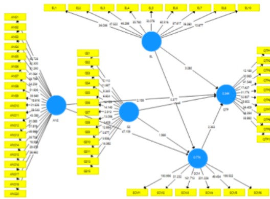
Figure 3: Structural Model Assessment