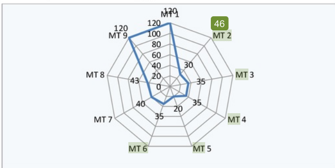
Figure 3. Number of pilgrims each majlis ta'lim .

The number of pilgrims majlis ta'lim can be described as follows, especially female congregation where at the time of holding a meeting in the routine always held social gatherings, savings and lend and read yasin tahlil or istighosah . The number of pilgrims on the chart can be seen below.