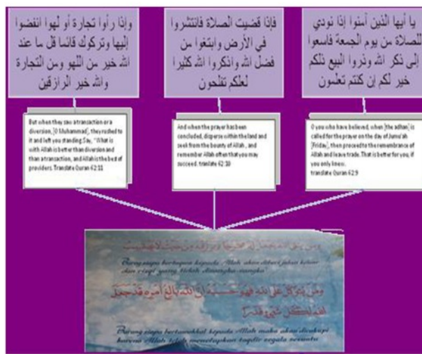
Figure 5. The verses of Quran are related to the economy: economic counseling of the Quran.

The Quran letter of Al Jum'ah verse 9-11 contains economic, and the rules when carrying out the economic activities are called by God to stop when the time calls prayer. When the prayer is finished, the faithful are expected to continue their economic business. The Quran al-Thalaq letter 2-3 to the psychological motivation is that when a man is a piety to God then for him will be given a solution to the difficulties experienced also sufficient all its intentions. There is economic power and devotion from Quran letter of Al Jum'ah and Quran Thalaq . So these verses can fulfill as economic counseling. The ta'lim majlis was chosen as the subject of research because the ta'lim majlis besides performing the function of worship by reading the letters yasin tahlil and istighosah there are also in it economic activities such as social gathering and saving and loan, where money is managed and used together and provides benefits even can also be used for productive business capital so as to improve the economics of majlis ta'lim congregation. As for clients who need economic Quran counseling there are six members of the congregation. The conditions before, in the process, and after the treatment of economic Quran counseling are as in Table 3.