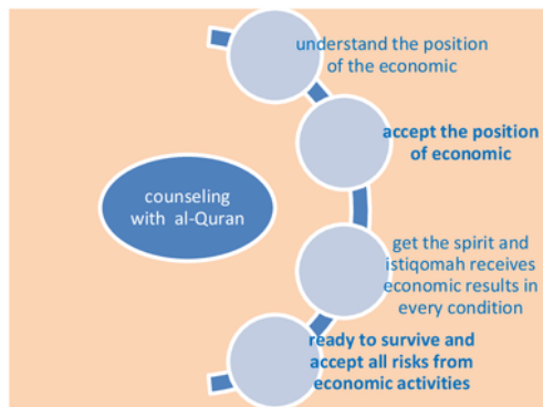
Figure 4. Stages of economic counselling.

The Quranic verses used as a tool for counseling are some Quranic verses about the secrets of faith and belief to believe in the verse for the client. The counselor delivered the verse to the client in several meetings and repeated the verse was read and explained. The counselor assures clients to follow God in the Koran's search for economy and encourages the importance of the client's maximum efforts and instills the importance of accepting all the fate of all efforts undertaken. Treatment by way of explaining the text of the Quran and then the treatment according to the material of the client are in accordance with Ternström et al. (2017, pp. 75-82) using the cognitive behavioral therapy approach by giving one or two sections to the text material, and so on—three tasks are closely related to these texts. The number of tasks varies from one-to-three per module and they are always closely related to the content covered in the text in the module. The module's contents are specifically designed for this study, discussing the role according to the client's condition in the first week of the selected client at random and performing the task according to the text provided feedback by counselor or psychologist and ensured the client experience and reinforced the client's positive condition through this behavioral cognitive therapy.