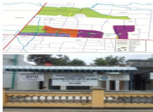
Figure 2 Map of Bajang Village

The results of the portrait of worshiper's majlis ta'lim who became the subject of research are as follows. That there are nine groups of majlis ta'lim in Bajang village where in each meeting one majlis each group held economic activities in the form of collection of savings and loans to the congregation. The economic activities obtained from pilgrims used by pilgrims are to add economic input based on data in field used by pilgrims to finance daily needs, increase the cost of school, and also increase the home industry business capital run by pilgrims. No research has been done in the previous village of Bajang. The results of research data majlis ta'lim until this year are as follows.