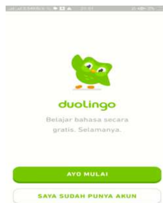
Figure 2.1 Duolingo Application's Register