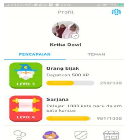
Figure 2.9 Badges in Duolingo Application