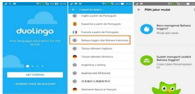
Figure 2.2 Language categories in Duolingo Application