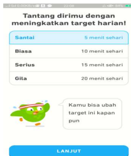
Figure 2.8 Level systems in Duolingo