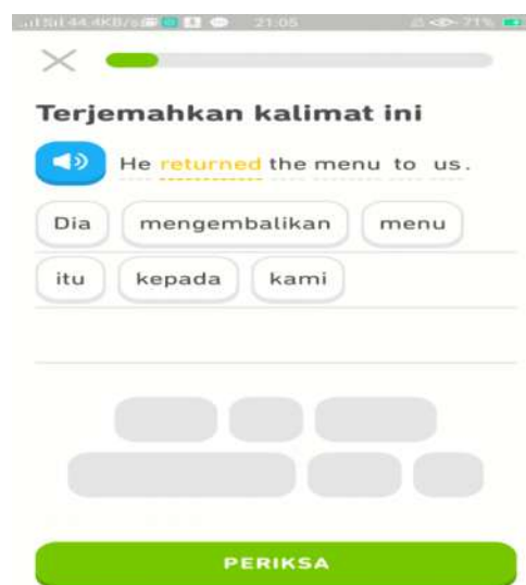
FIGURE 2.5 Duolingo Application's level

Each lesson consist of several questions that begin with an introduction to vocabulary which continues the arrangement of short sentences. For each correct answer, The user be rewarded a value that later be calculated as the final grade.