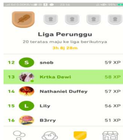
Figure 2.7 Duolingo's Leader board