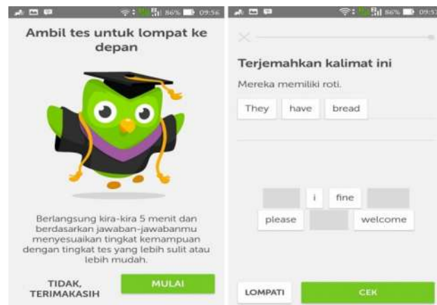
Figure 2.4 Introduction Level Duolingo application

Each lesson consist of several questions that begin with an introduction to vocabulary which continues the arrangement of short sentences. For each correct answer, The user be rewarded a value that later be calculated as the final grade.