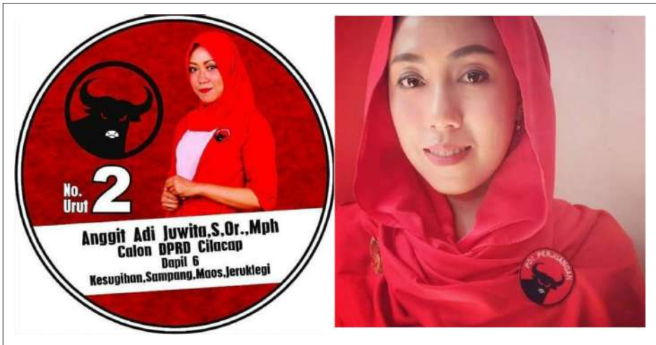
Figure 4. Anggit Adi Juwita, a Successful Candidate for the Indonesian Democratic Party of Struggle ( Partai Demokrasi Indonesia Perjuangan , PDIP).

(a well-known singer) and Ammy Amalia Fatma Surya (the daughter of a prominent leader of the modernist organisation Muhammadiyah), both of whom are Muslim, supplemented their standard campaign images and appearance (on the left) with the images on the right, which they used in locations close to religious boarding schools.