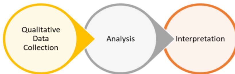
Figure 1 Research Design

The collected data was then coded and analyzed qualitatively to explain the general description of the creative writing teacher's competence development activities. Qualitative analysis was carried out thematically to explore and find the concept of developing writing teacher professionalism in the planning, implementation, and obstacles faced segments.