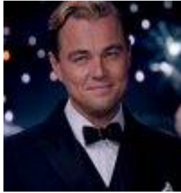
Leonardo DiCaprio as Jay Gatsby