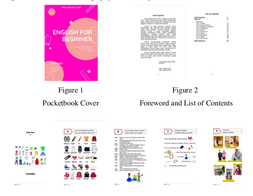
Figure 4 English for Beginner Pocket Book Material Presentation

for beginners, vocabulary, reading text, dialogue, language focus, and exercises. The closing section contains a bibliography and author profile.