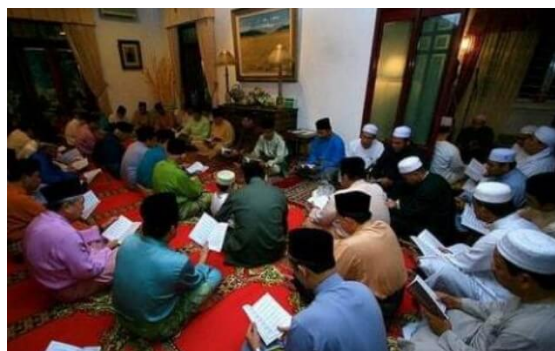
Picture 5. Kenduren of someone's death tradition

Javanese often use Kenduren as a reminder when someone has died. When a person dies they will hold a 'joint prayer' from the first day to seven days then they will repeat when the person dies 40 days and last when 100 days. People always hold this event when people die as a sense of shodaqoh because the person who died had a very good heritage. The community has an obligation to hold a Kenduren as a means of praying for the deceased and then they invite many people to come to his house to be able to pray for the person who has died to enter the best place on the side of God. Slack at the time of a person's death can be seen in Picture 7.