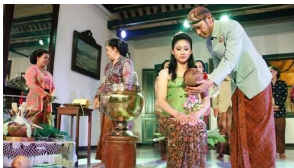
Picture 1. The tradition of kenduren mitoni

The kenduren tradition starts from the womb, the salvation ceremony has been carried out by the Javanese people. The traditional ceremony for pregnant women starts from the age of one month of pregnancy with the Wilujengan traditional ceremony or salvation ngeborebore . This ceremony is intended so that the fetus in the womb is safe and not aborted or damaged. There is also a traditional ceremony of the fetus at the age of two months, three months to nine months. The ceremony for pregnant women continues until the baby is ready to be born. The Kenduren Mitoni tradition is shown in Picture 1.