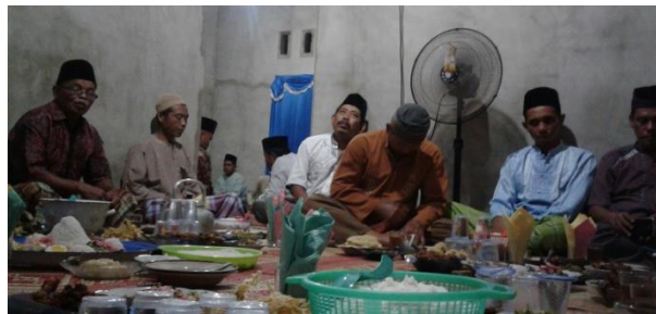
Picture 6. Kenduren Selapanan

birth, experience physical changes in the form of an increase in body temperature, restlessness, and often cry. Selapanan comes from the Javanese language which means 35 days. So, selapanan is a ritual performed on babies who have turned 35 days old. This salvation event is carried out when the baby is 35 days old or selapan . This calculation is based on the Javanese calendar, so that the Javanese people count the days in a matter of weeks as many as seven days (Monday - Sunday) and the calculation where one market operates for five days ( Pahing, Pon, Wage, Kliwon, and Legi ). The calculation of the selapan is derived from multiplying between seven and five which yields 35 days. On the 35th day, the number of multiples of seven and five is met. On this day too, the baby's weton day will repeat itself. For example, if the baby is born on Thursday Pahing , then his selapanan will fall on Thursday Pahing as well. The picture 8 bellow as the example of Kenduren Selapanan .