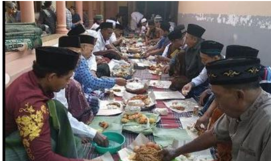
Picture 4. Kenduren tradition the big day of Islam

The people also used to hold the Kenduren of the Great Day of Islam. The Kenduren of the great day of Islam begins when Ramadhan they always hold this event as a reminder that we will enter the holy month. The month of Ramadhan that can remove the sins of Muslims so they hold Kenduren as a sign of gratitude. The people will arrive in a truly blessed month. People also used to hold this event on other big days such as Isra 'Mikraj and others as a sign of piety. The Kenduren of the big day of Islam is performed by the general public, the feast is also usually held with the purpose of common prayer, for example when commemorating Muludan (birthday of the Prophet), Rajaban , Suronan (10 muharram), likuran (on the 21st day of Ramadan), ba'dan (Eid al -Fitr & Eid al -Adha ) etc. An example of the big day of Islam can be seen in Picture 6.