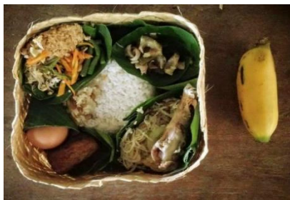
Picture 2. Gudangan rice