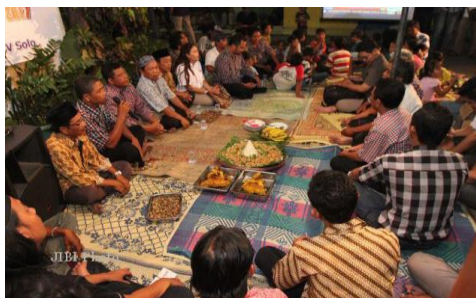
Picture 3. Kenduren Syukuran

Kenduren Syukuran aims to pray together and express gratitude because the desired hope has been achieved. Thanksgiving has an example when passing a job exam, being a civil servant, buying a new car or motorcycle and so on. The feast is held by giving alms to the surrounding community by inviting them to come together to praise and enjoy food together. An example of the tradition of thanksgiving slack can be seen in Picture 5.