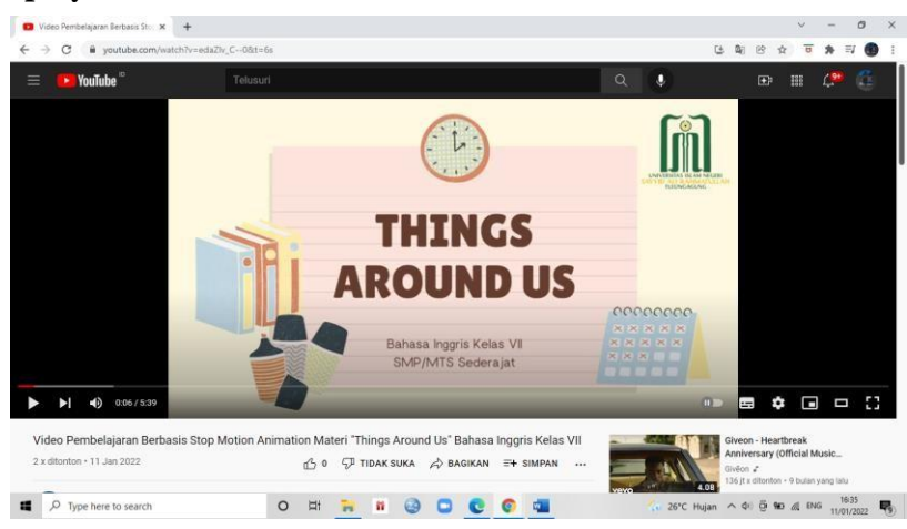
Chart 2 Display about Instructional Broadcast Entrenched Freeze Frame Liveliness

In every aspect about every assessment apart instructional broadcast entrenched freeze frame liveliness, the average percentage part every teacher's perception of the use of learning media for training vocabulary is 97% also became inserted in the accurate classification. Everf coming seemed one display about instructional broadcast entrenched freeze frame liveliness deployed by pupils related the lexicon training process.