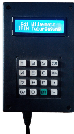
Figure 2. Jo-Klimah Microcontroller Display

The Jo-Klimah hardware used in flexibility training uses ultrasonic sensors. Ultrasonic sensors were sensors that use ultrasonic waves or sound waves (physical), these waves could not be detected by our senses, both hearing and sight. These waves were at a very high frequency, which was approximately 20,000 Hz to 40,000 Hz (Bhatt & Trivedi, 2018). The ultrasonic wave system worked the same as the working principle of radar, which was to emit waves with a certain frequency and would be received back by the wave receiver if it hit an object. Ultrasound sensors were very versatile in distance measurement. They also provided the cheapest solution. Ultrasonic waves could be used to be channeled in air or in water, ultrasonic sensors propagate quite quickly (Shrivastava et al. , 2009). Detection of the existence of the distance was obtained from the speed of the wave with the time used when sending the wave until the time when the reflected wave propagated back by the sensor at a speed of about 340 meters per second.