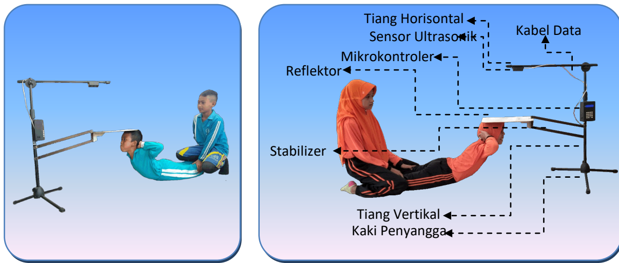
Figure 3. Flexibility Exercises Using Jo-Klimah

Students in doing flexibility exercises using the Jo-Klimah tool were very enthusiastic and motivated because they could directly see the results of flexibility on the display, so students were excited to be encouraged to produce higher or more flexible, in this case our emotions affect flexibility. Motivation was a process in which students' internal energy or needs were directed at various goal objects in their environment, in other words, motivation was a condition that increases the desire to do better (Fatih Kucukibis & Gul, 2019; Zeng et al. , 2017). Motivation in physical activity refers to dispositions, social variables, and cognitions that come into play when a person performs a task in which he was evaluated, or enters into competition with others, or attempts to compete to achieve a standard of excellence (Robert, 2014: 49). The advantage in this case was the value of flexibility where everyone would be able to know the results directly, both the results of themselves and the results of other students, so that they competed to get maximum results. Variations in training and the choice of forms of exercise caused sports actors to increase their studies with new methods with the same goal of improving performance (Cahyono et al. , 2018; Pratiwi et al. , 2018). A more suitable motive was intrinsic motivation for involvement in increasing the level of student flexibility.