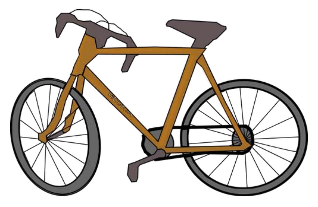
Please tell me about your experience based on this picture with your own words. You only have 5 minutes to tell the story.