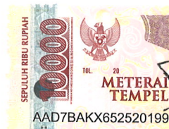
Isnia Wulan Suci