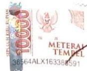
UMI LAELATUS SURURIYAH