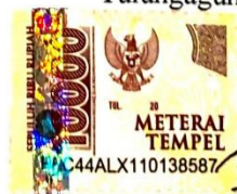
UMI LAELATUS SURURIYAH