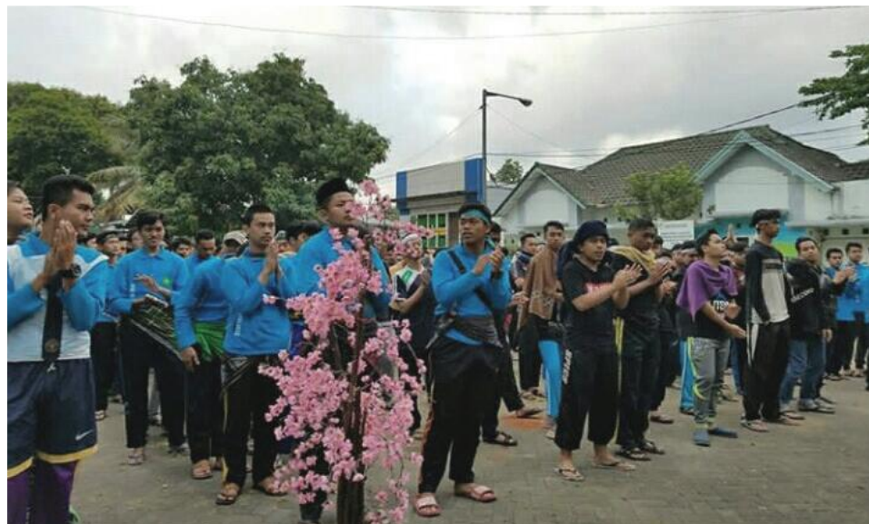
Figure 4. Activities of Shabah Lughah

This statement explains that the creation of a language environment greatly influences student motivation in learning. Learning motivation greatly influences success in the learning process. Therefore, a conducive language environment must be designed as much as possible to support the learning process. A conducive language environment and a cheerful mood in learning can be seen in the following picture.