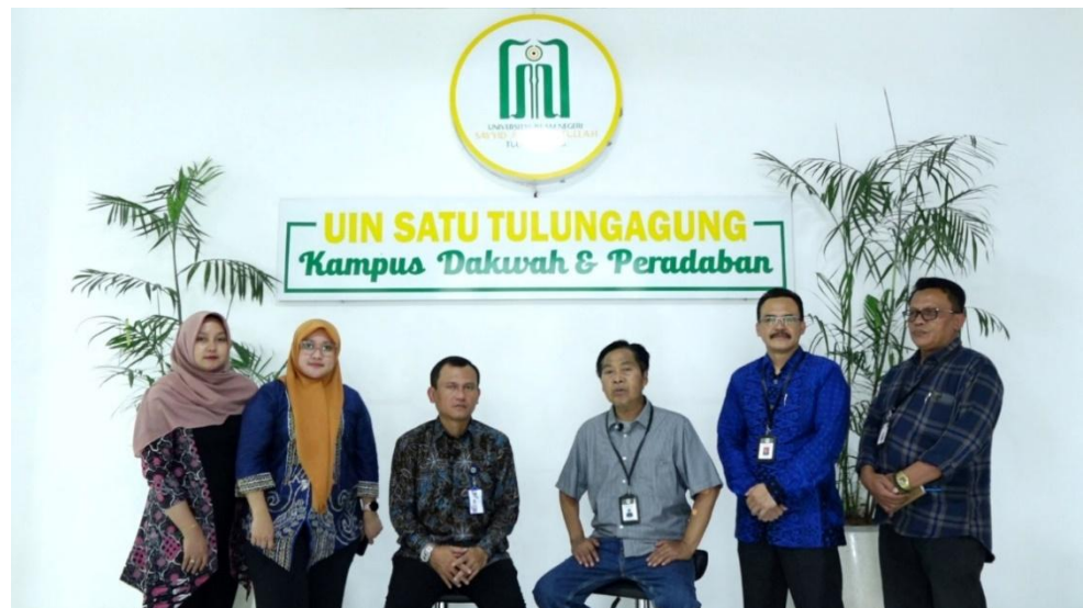
Figure 8. UIN Satu Tulungagung as a Dakwah and Civilization Campus

As can be expected, the majority of academics at IAIN Tulungagung understand this idea from an old perspective. Dakwah is preaching, a prophetic mission carried out by relying on charismatic relationships and based on oral communication.