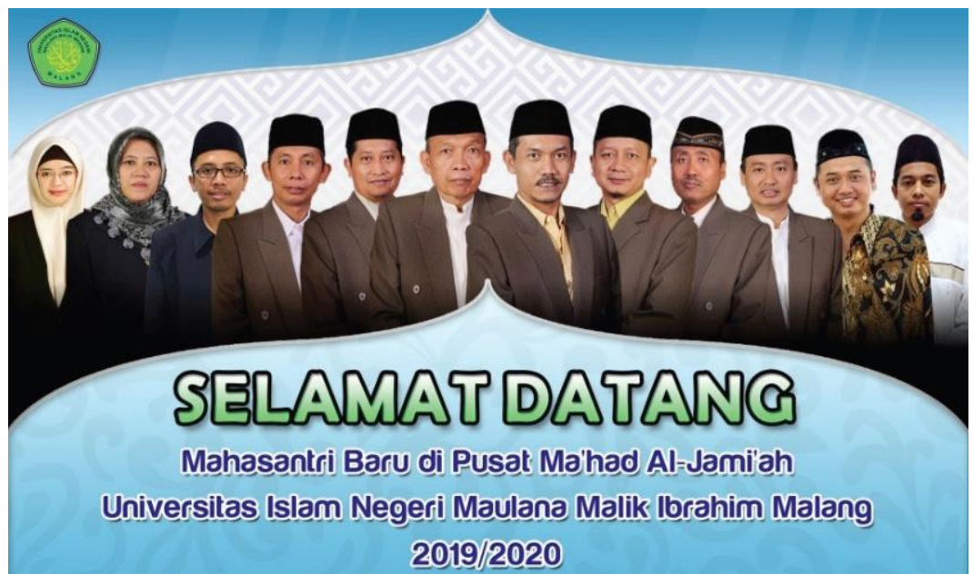
Figure 3. Photo of the Kyais of Ma'had Al-Jami'ah

The activity process at Ma'had Al-Jami'ah is managed professionally. The management structure consists of; kyai, mu'allim (teachers), murabby, musyrif, and musyrifah. The Kyai board is selected from lecturers who have Islamic boarding school qualifications and can educate Ma'had Al-Jami'ah well. Here is the photo of the council of Kyai Ma'had Al-Jami'ah: