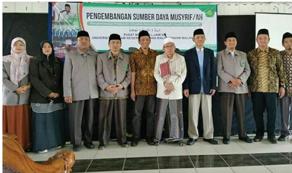
Figure 5. Increasing Ma'had Al-Jami'ah HR Competency

Figure 5 explains that UIN Maulana Malik Ibrahim Malang's efforts to increase the professionalism of human resources in Ma'had are of great concern for the continuity of activities that are right on target.