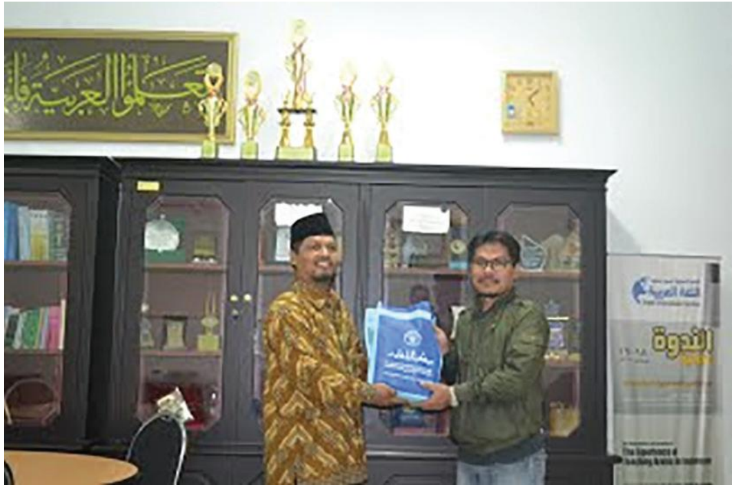
Figure 1: Language Strengthening Collaboration

Figure 1 explains that the Head of the Language Development Center of UIN Maulana Malik Ibrahim Malang gave a learning book symbolically as a form of starting cooperation in strengthening language between UIN Maulana Malik Ibrahim Malang and IAIN Manado. Collaboration implementation activities are carried out in the form of training for students and lecturers, learning books, learning media, and the establishment of a new ma'had Al-Jami'ah .