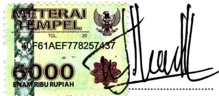
ULFATUN NIKMAH Namaterangdantandatangani

Tulungagung, 14 Desember 2017 Yang Menyatakan,